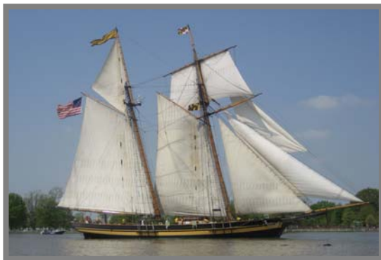
Pride II in the Washington Channel